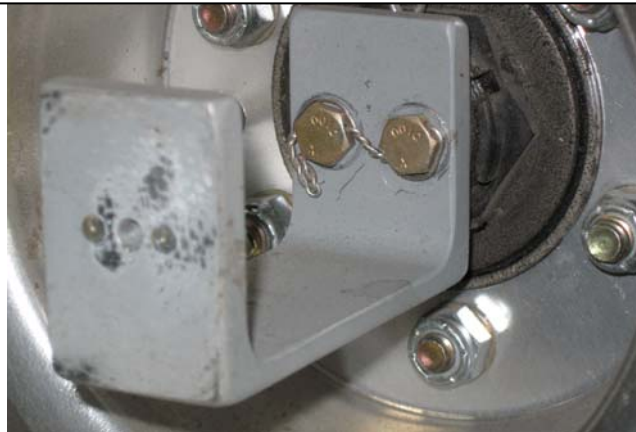
Figure 2: Replacement wheel pant bracket, bolts and safety wire